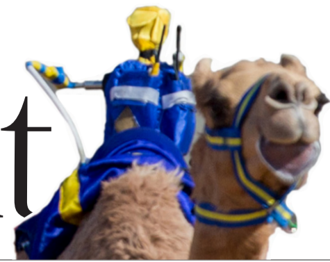
Lightweight, electric-powered robots are fixed to the camels' backs before the race.